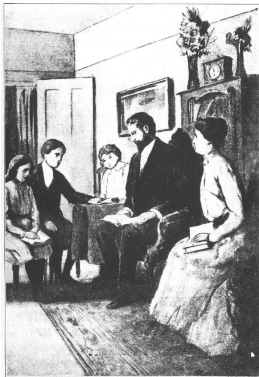
A HAPPY HOME.

There are but few sweeter words in the English language than the word home . I have thought the three sweetest words are mother , home , and heaven . Home is the dearest place in all the world to the Christian heart. To have a fond love for home is not at all injurious to Christian character. Those who have but little love for home will never succeed well in