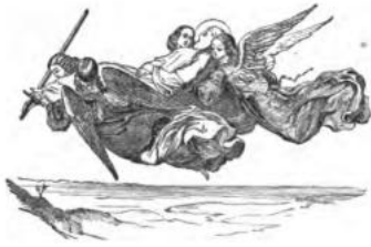
ST. CATHERINE BORNE BY ANGELS.